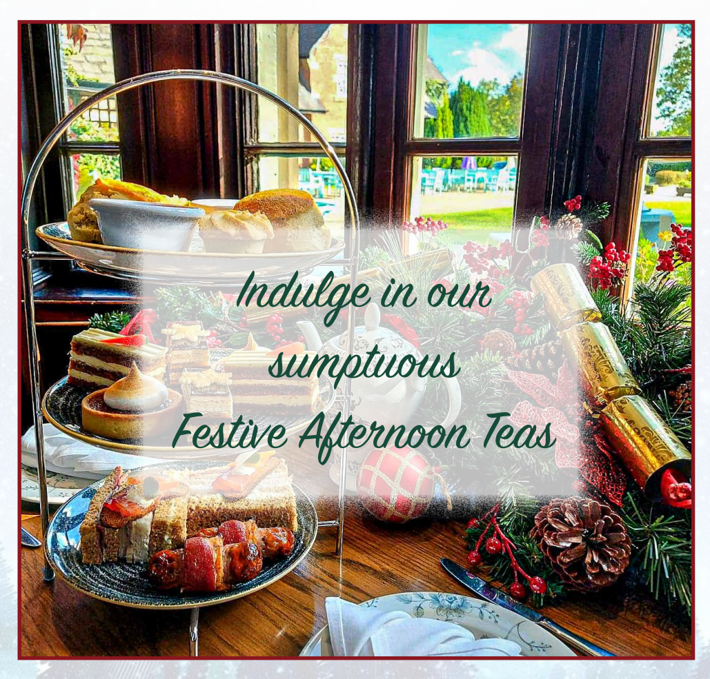
ALL FESTIVE AFTERNOON TEA ITEMS ARE SUBJECT TO CHANGE, BASED UPON AVAILABILITY.