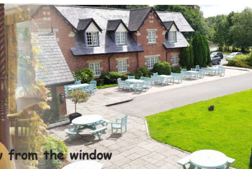
Beautiful view from the window

Email reception@thevilla.co.uk for more information